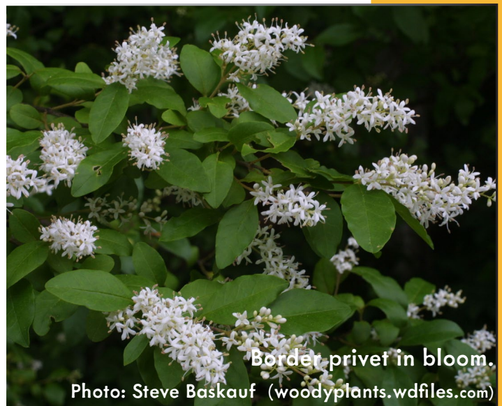
Border privet in bloom.